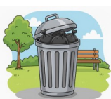
BAGGED TRASH ONLY