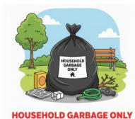
HOUSEHOLD GARBAGE ONLY