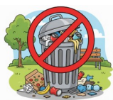
NO LOOSE TRASH