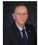
Mike Eason, Mayor

Please stop by the "Coffee with the Mayor" on August 25, 2018 at 8:30 AM until 11:00 AM in the lobby of City Hall. It's a great opportunity to ask questions, have a cup of coffee and to meet your elected officials.