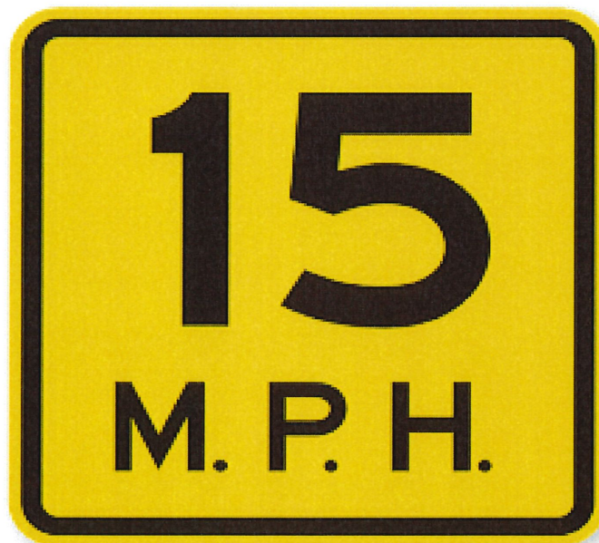
W13-1P - 18X18