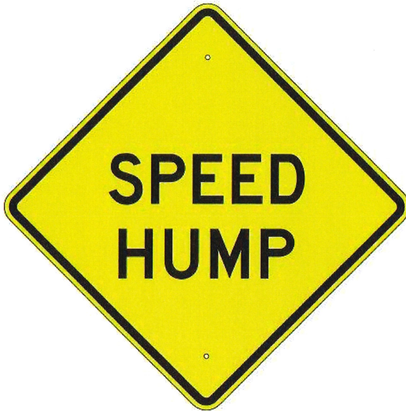
W17-1 - 30X30