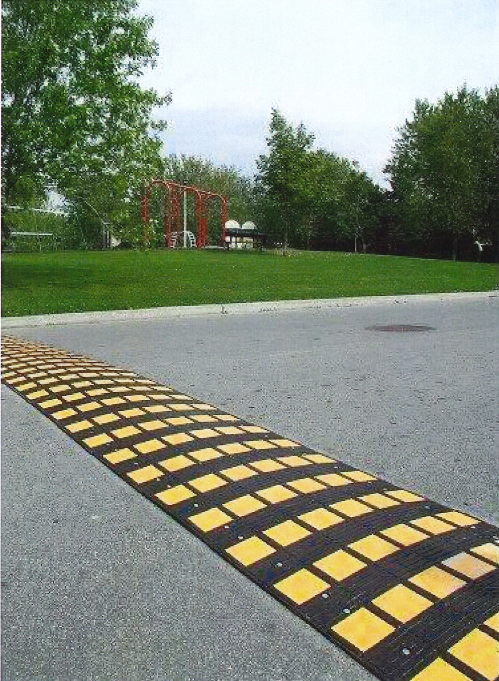
JR MINI SPEED HUMP